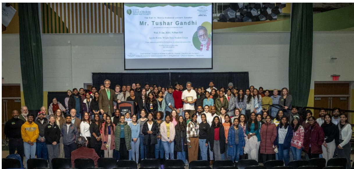
Tushar Gandhi and the Pharmacology & Toxicology family!

We in the Department wish to extend our gratitude for the many collaborators for this event, to include the WSU College of Liberal Arts, Event Services, Division of Inclusive Excellence, Special Collections and Archives, University Center for International Education, Dining Services, Office of Marketing, and Newsroom.