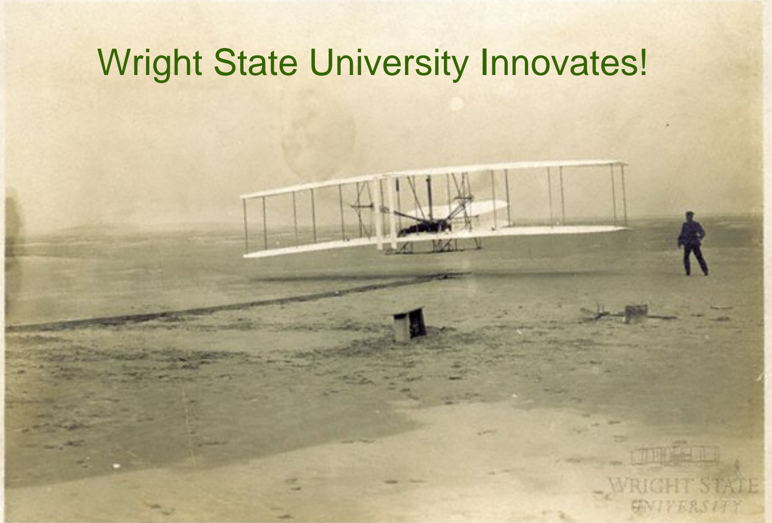
First flight of power driven machine. Dec 17, 1903