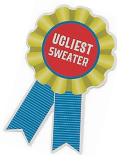
This year it wasn’t even close!